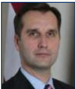
Mr Māris Riekstiņš, Minister for Foreign Affairs