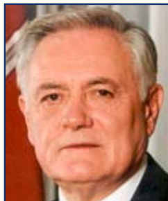
Mr Valdas Adamkus, President