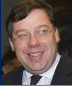
Mr Brian Cowen, Prime Minister