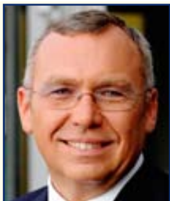
Mr Alfred Gusenbauer, Federal Chancellor