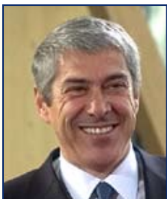
Mr José Sócrates, Prime Minister