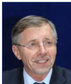
Mr Gediminas Kirkilas, Prime Minister