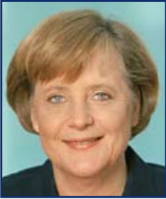
Ms Angela Merkel, Federal Chancellor