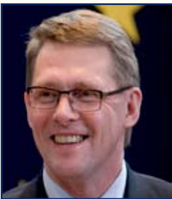
Mr Matti Vanhanen, Prime Minister