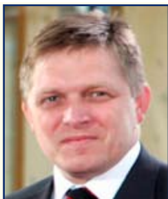
Mr Robert Fico, Prime Minister