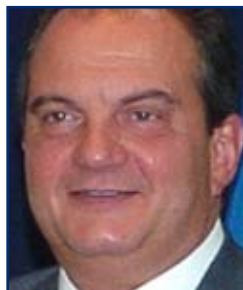
Mr Costas Karamanlis, Prime Minister