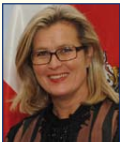
Ms Ursula Plassnik, Federal Minister for European and International Affairs