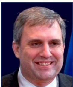
Mr Ivailo Kalfin, Minister for Foreign Affairs