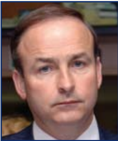
Mr Micheál Martin, Minister for Foreign Affairs