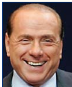
Mr Silvio Berlusconi, Prime Minister