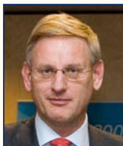
Mr Carl Bildt, Minister for Foreign Affairs