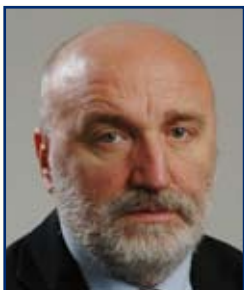
Mr Ivars Godmanis, Prime Minister