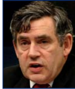
Mr Gordon Brown, Prime Minister