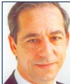
Mr Lawrence Gonzi, Prime Minister