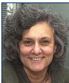
Ms Kinga Göncz, Minister for Foreign Affairs