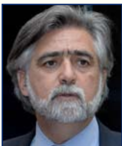
Mr Luís Amado, Minister for Foreign Affairs