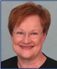
Ms Tarja Halonen, President