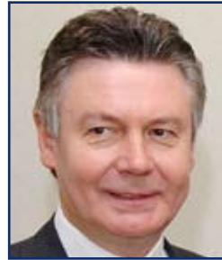
Mr Karel De Gucht, Minister for Foreign Affairs