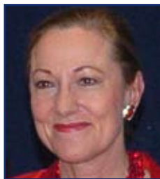
Ms Benita Ferrero-Waldner, Member