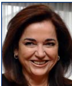
Ms Dora Bakoyannis, Minister for Foreign Affairs