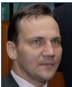
Mr Radosław Sikorski, Minister for Foreign Affairs