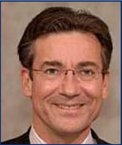
Mr Maxime Verhagen, Minister for Foreign Affairs