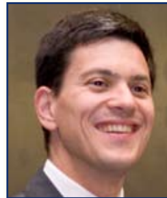
Mr David Miliband, Secretary of State for Foreign and Commonwealth Affairs