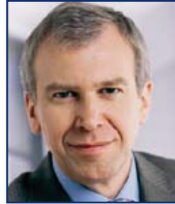
Mr Yves Leterme, Prime Minister