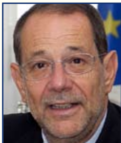
Mr Javier Solana, Secretary General /High Representative