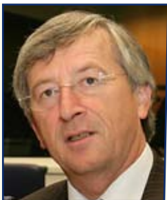
Mr Jean-Claude Juncker, Prime Minister