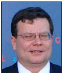
Mr Alexandr Vondra, Deputy Prime Minister with responsibility for European Affairs