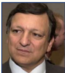
Mr José Manuel Barroso, President