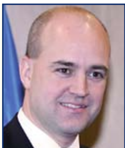
Mr Fredrik Reinfeldt, Prime Minister