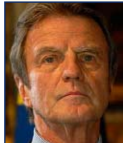
Mr Bernard Kouchner, Minister for Foreign and European Affairs