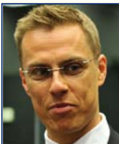
Mr Alexander Stubb, Minister for Foreign Affairs