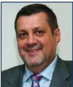
Mr Ján Kubiš, Minister for Foreign Affairs