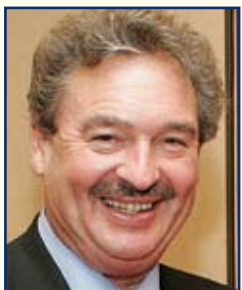
Mr Jean Asselborn, Minister for Foreign Affairs and Immigration