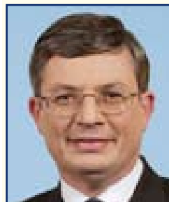
Mr Tonio Borg, Parliamentary Secretary, Ministry of Finance