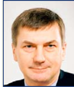
Mr Andrus Ansip, Prime Minister