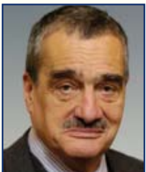
Mr Karel Schwarzenberg, Minister for Foreign Affairs