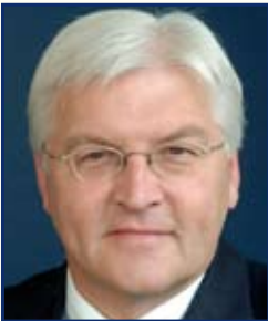
Mr Frank-Walter Steinmeier, Federal Minister for Foreign Affairs