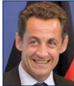
Mr Nicolas Sarkozy, President