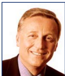
Mr Mirek Topolánek, Prime Minister