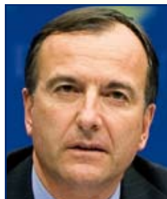
Mr Franco Frattini, Minister for Foreign Affairs