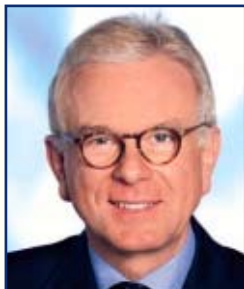
Mr Hans-Gert Pöttering, President