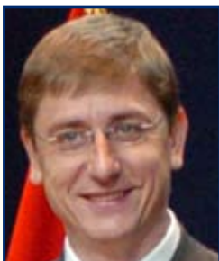
Mr Ferenc Gyurcsány, Prime Minister