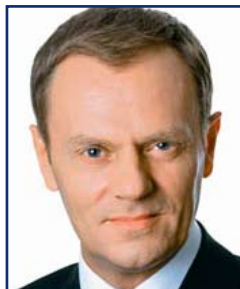
Mr Donald Tusk, Prime Minister