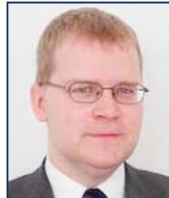
Mr Urmas Paet, Minister for Foreign Affairs