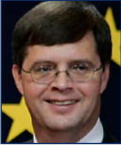
Mr Jan Peter Balkenende, Prime Minister