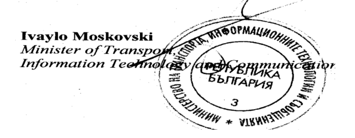
Ivaylo Moskovski Minister for Transport, Information Technology and Communications Bulgaria